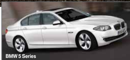
BMW 5 Series