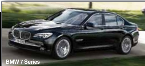
BMW 7 Series

Owning a BMW isn't only about hitting the road. It's also about getting the treatment you deserve. Enjoy superior service, benefits, and value with a BMW from Lauderdale BMW. Our well equipped models include no-cost maintenance, fuel efficient engines, and exhilarating performance. The BMW Exceptional Customer Service Commitment is our promise to bring you the superior service that's an essential part of your ultimate driving experience.