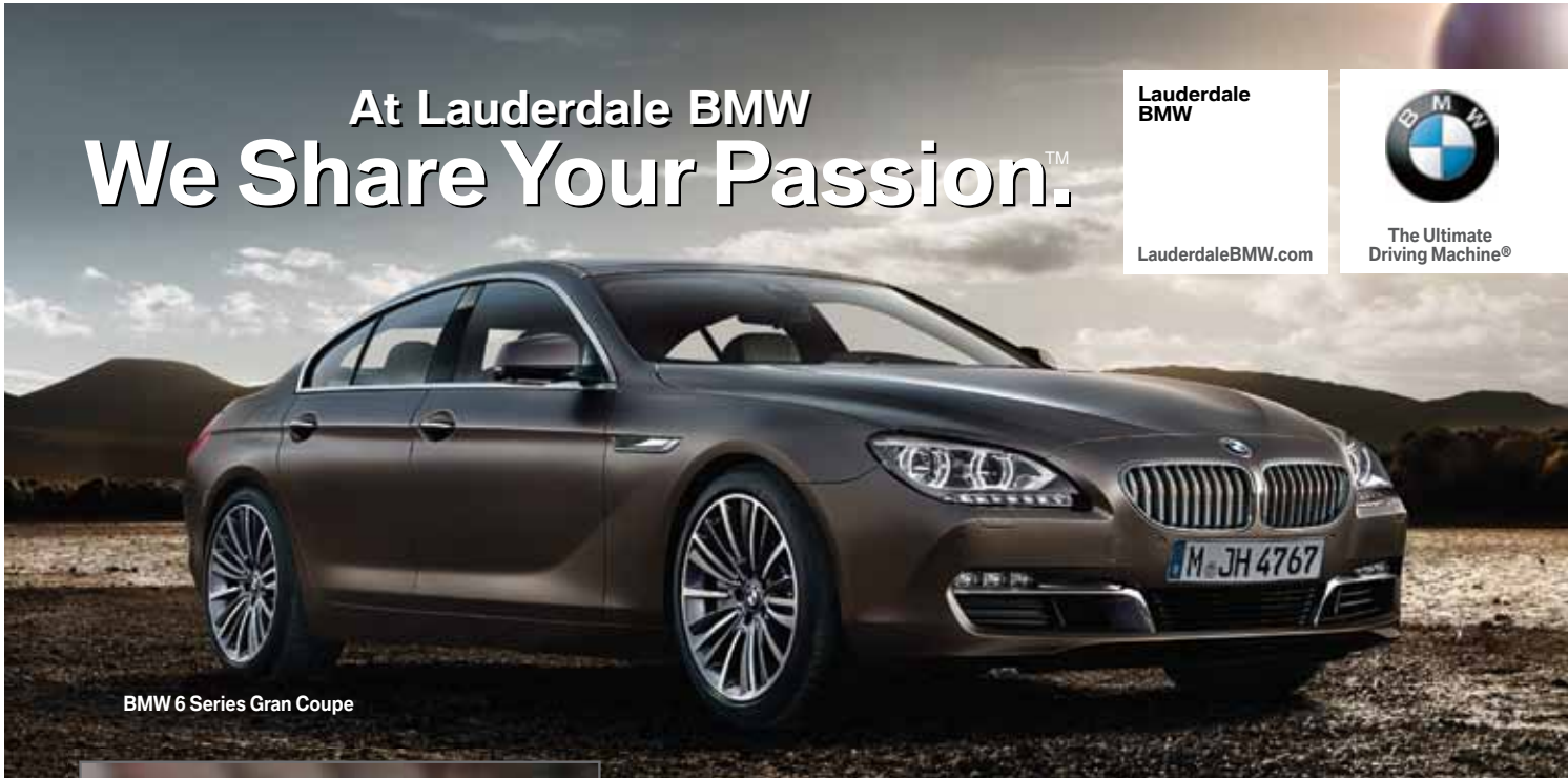
BMW 6 Series Gran Coupe