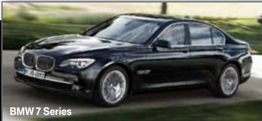
BMW 7 Series

Owning a BMW isn't only about hitting the road. It's also about getting the treatment you deserve. Enjoy superior service, benefits, and value with a BMW from Lauderdale BMW. Our well equipped models include no-cost maintenance, fuel efficient engines, and exhilarating performance. The BMW Exceptional Customer Service Commitment is our promise to bring you the superior service that's an essential part of your ultimate driving experience.