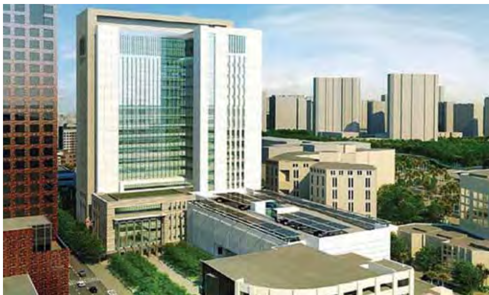
Architectural Rendering by The Spillis Candela & Partners/Heery/Cartaya Joint Venture