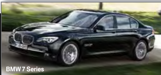
BMW 7 Series

Owning a BMW isn't only about hitting the road. It's also about getting the treatment you deserve. Enjoy superior service, benefits, and value with a BMW from Lauderdale BMW. Our well equipped models include no-cost maintenance, fuel efficient engines, and exhilarating performance. The BMW Exceptional Customer Service Commitment is our promise to bring you the superior service that's an essential part of your ultimate driving experience.