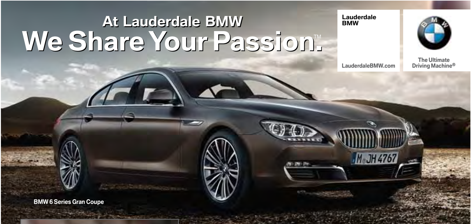
BMW 6 Series Gran Coupe