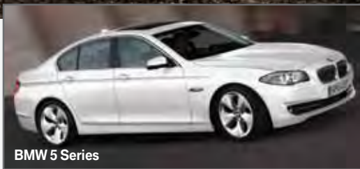
BMW 5 Series