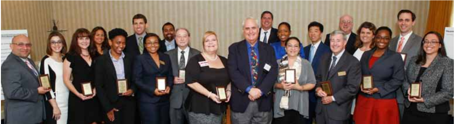
The 17th Judicial Circuit Pro Bono Committee recognized pro bono contributions on Law Day.