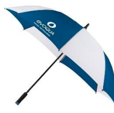
Auto Open Umbrella - $3,500