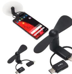
Portable Phone Fan - $1,000