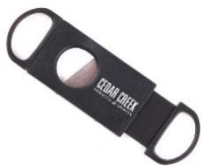
Cigars & Cutter - $1,250