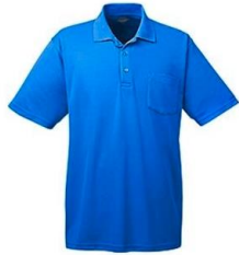
Golf Polo - $5,000