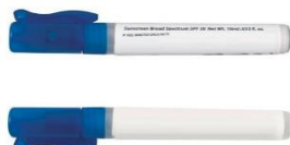
Sunscreen - $500