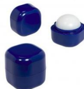
Lip Balm - $500