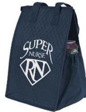
Cooler Bag - $1,500