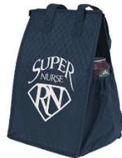
Cooler Bag - $1,000