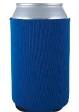
Koozie - $1,000