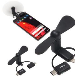
Portable Phone Fan - $1,000