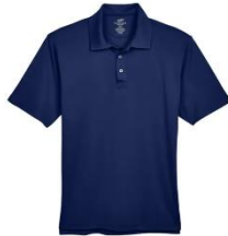
Golf Polo - $3,000