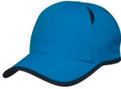
Dry-Fit Golf Hat - $3,500