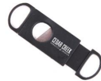
Cigar, Cutter & Lighter - $1,500