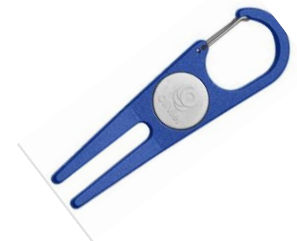
Ball Marker & Divot Tool - $750