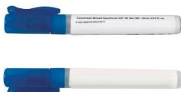
Sunscreen - $500