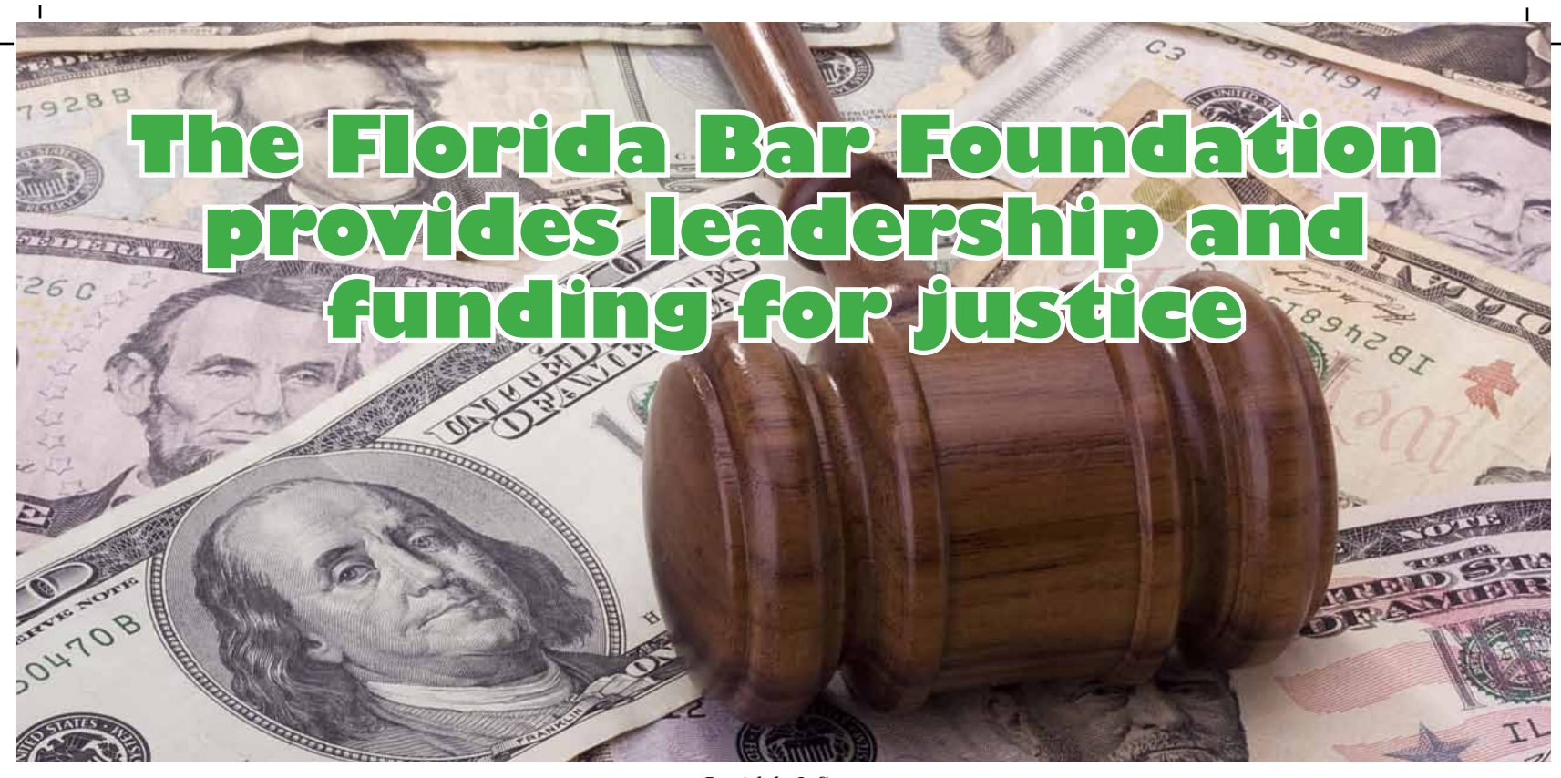
By Adele I. Stone

As lawyers we share a commitment to justice. The Florida Bar Foundation, a501(c)(3) public charity, turns that commitment into action through its funding of programs that provide access to justice for Floridians living inpoverty. Through our support of The Florida Bar Foundation, we can demonstrate our belief that the justice system works best when it works for everyone - regardless of his or her economic status.